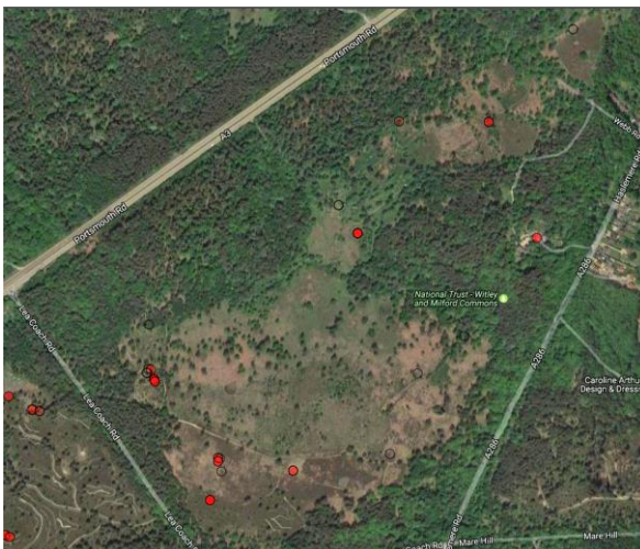
Figure 1 - Early adder sighting records